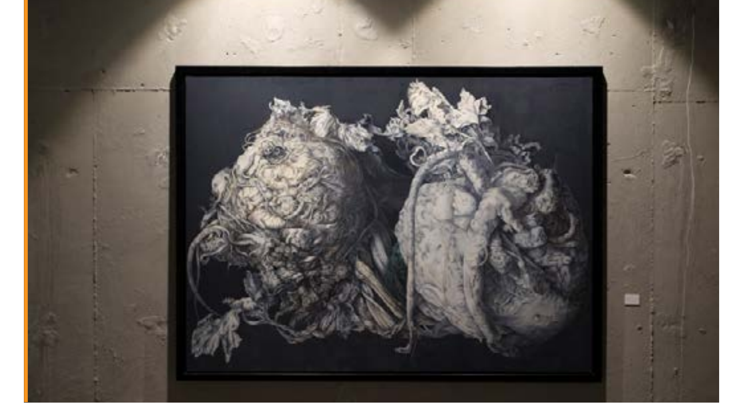
Oil on Unlinet linen canvas 155x213 cm 2012