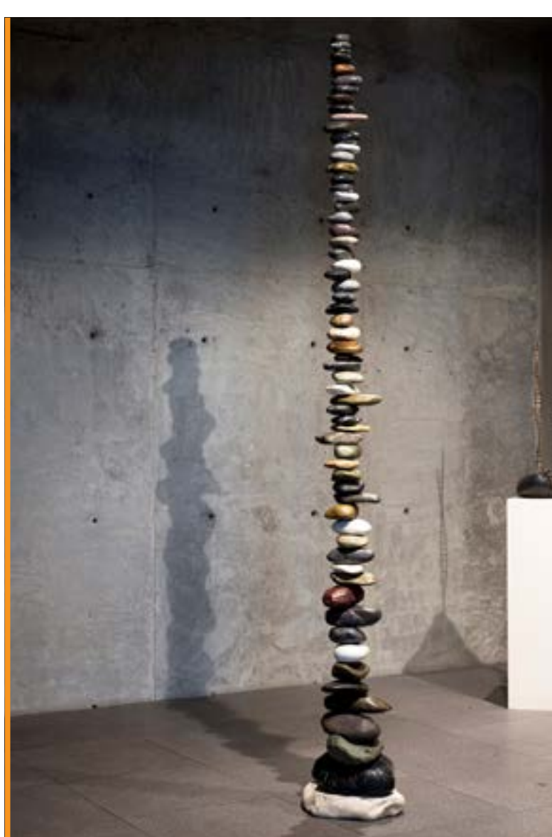
Metaphor 40x38x270 cm Stone,bronze 2014