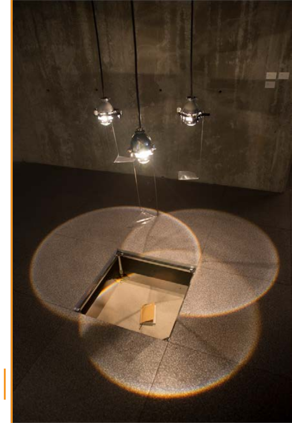
Guess What? Bus Headlight acetate 2014