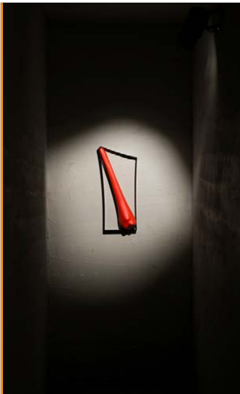
Ret 4 65x31x11 cm Wood, Metal 2012