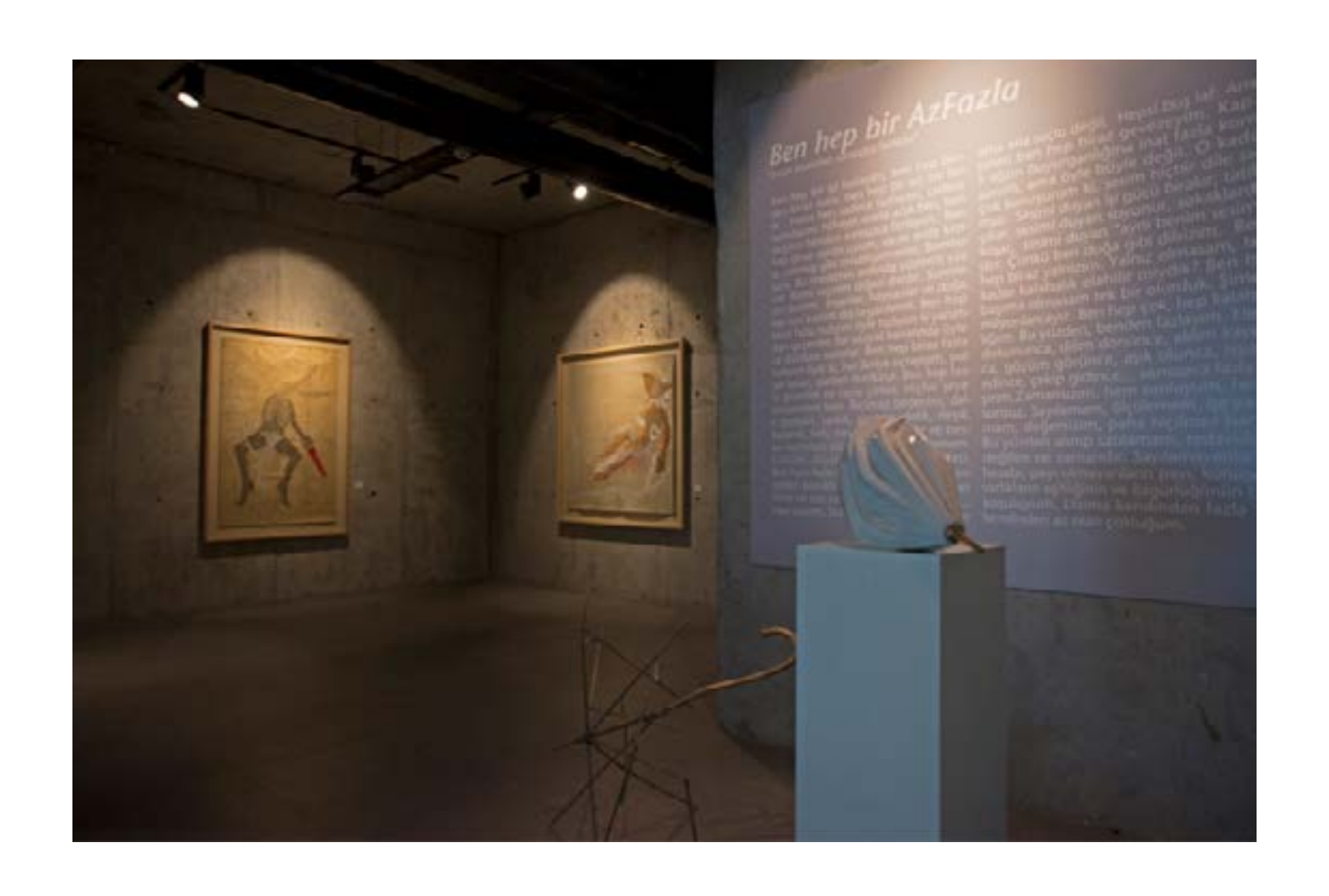
for Cem Ersavcı...