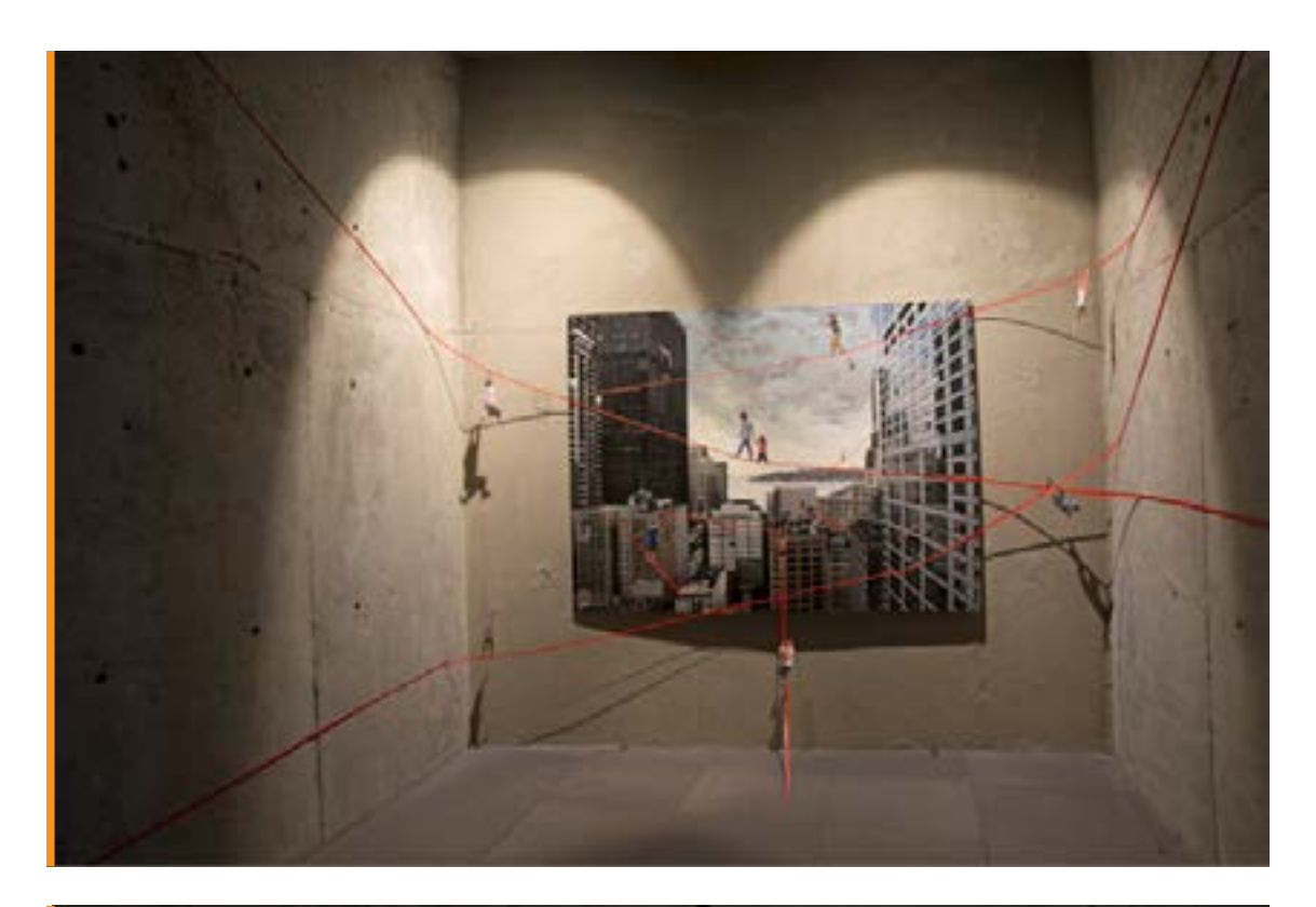
The best man win 260x200x2,5 cm Mixed tecnique 2013