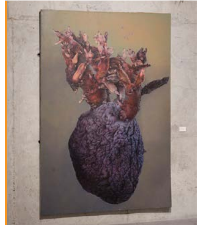
Oil on Cnvas 210x140 cm 2014