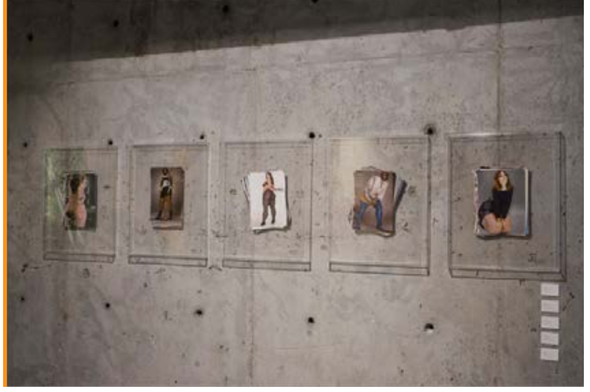
Toy with proportions 50x60 cm Mixed tecnique 2013