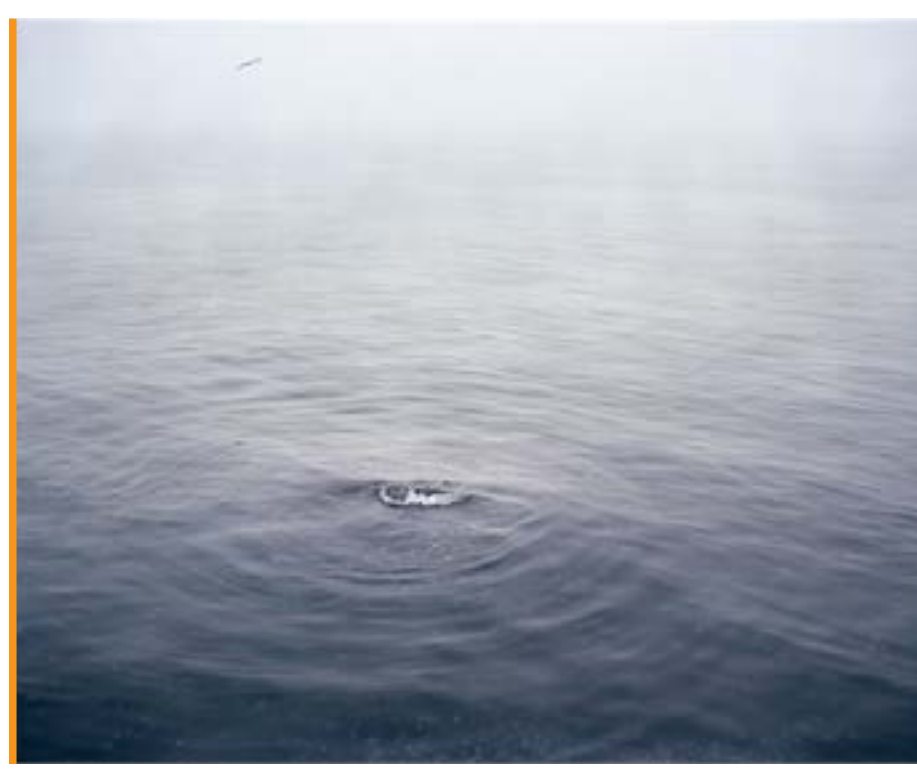
Landscape, İstanbul C-Print photo 60x50 2014