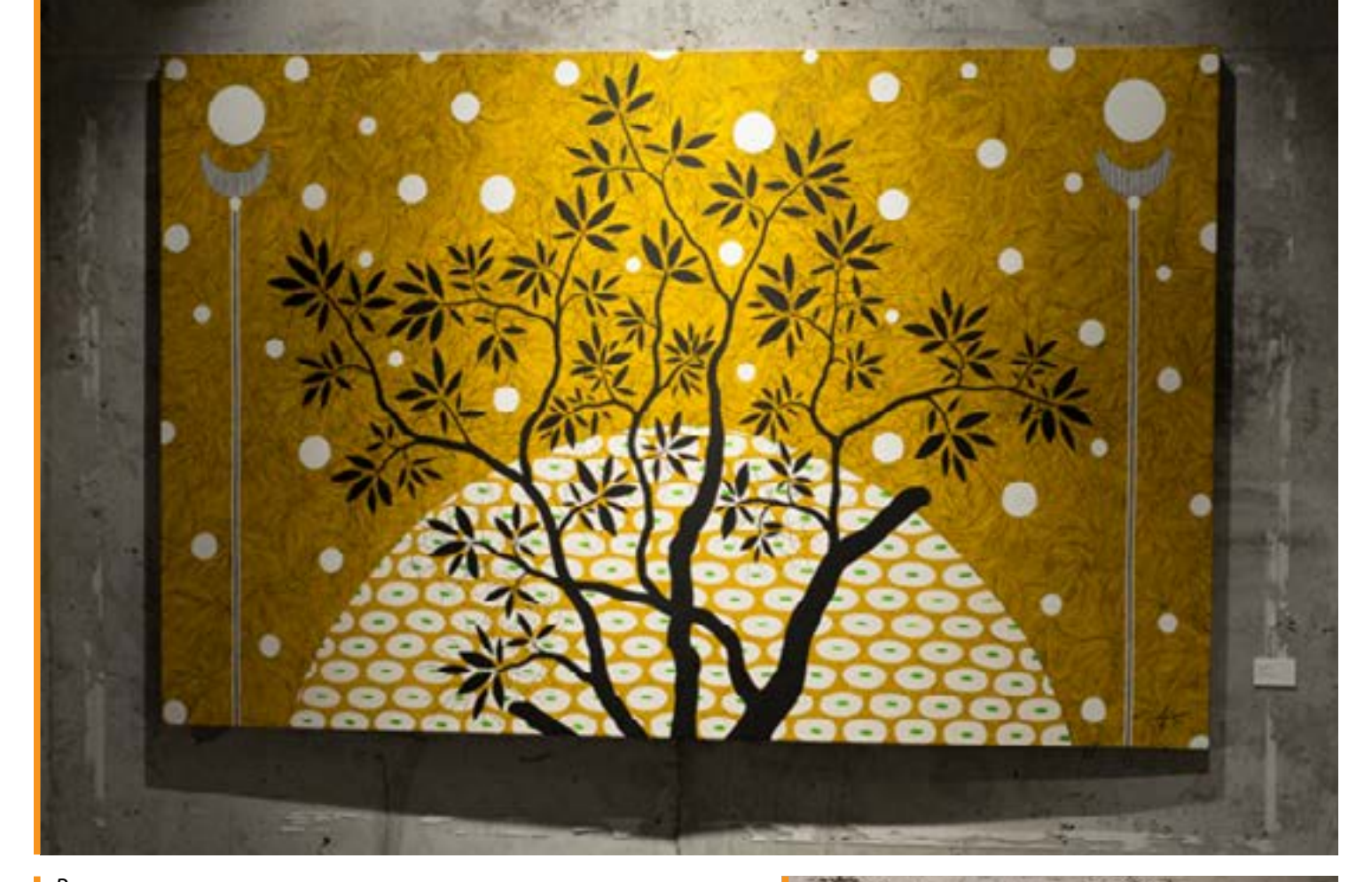
Baran 130x200 cm Oil on canvas