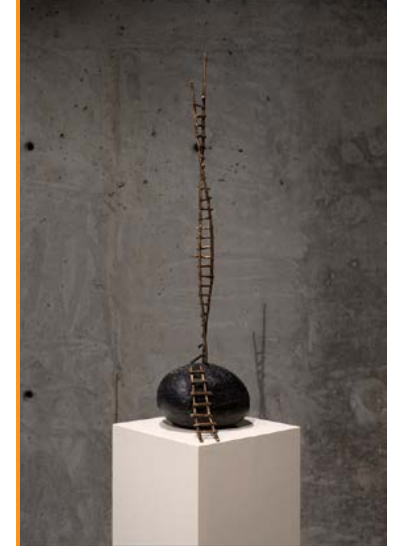
Elsewhere 85x31x21 cm Stone, bronze 2014