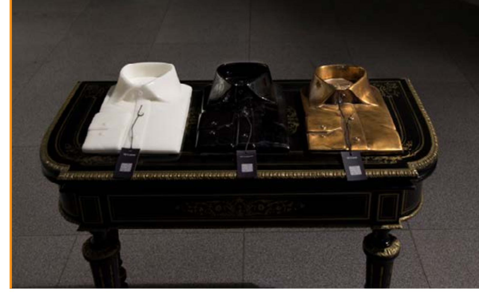
The System 65x32x7,5 cm Marble, Polyester,bronze,paper QR KOD 2014