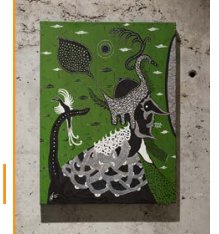
Lane 130x100 cm Oil on canvas 2014