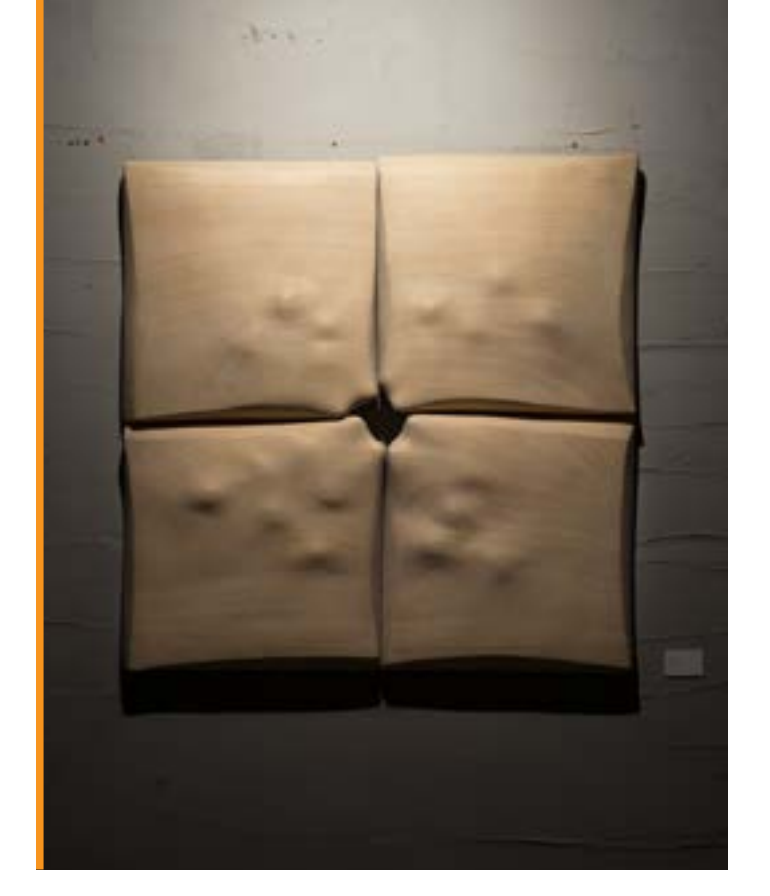
Purification V Wood 101x100x10cm 2012